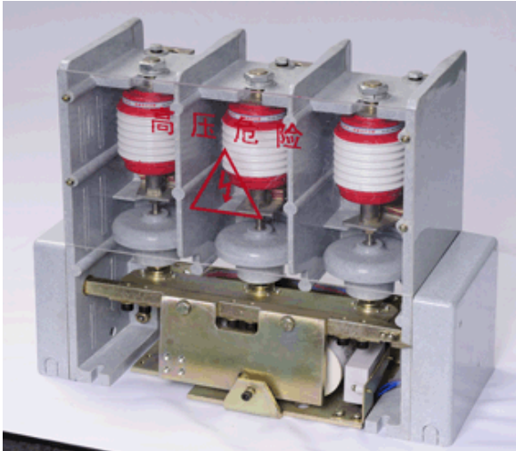
JCZ630A/7.2kV-S AC Vacuum Contactor